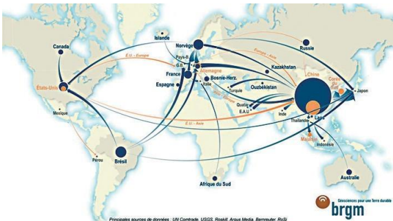
— SILICON METAL PRODUCTION AND TRADE WORLDWIDE IN 2019

Should tensions or crises arise, OFREMI will be able to provide rapid insight to assist policy-makers and the private sector.define the best possible responses.